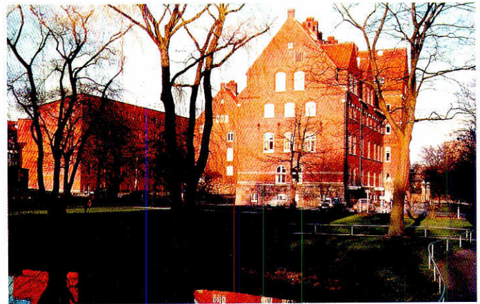
Fig. 3. The Department of Zoophysiology was initially housed in the Zoology building (right) but moved into a new building (left) in 1967. The Department is still in the same place but has modified its name to Animal Physiology.

The sea urchin studies had gradually changed their character. While initially the main attention had been paid to mitotic gradients and patterns in the developing eggs/embryos, the activity was subsequently directed towards the problems behind the rapid synthesis of nucleic acids from the nucleotide pool stored in the egg (Agrell and Persson, 1956). Great efforts were spent on the biochemical analyses involved, i.e. to find out whether a special cytoplasmic DNA was operating at the earliest stages. Even if this idea could not be confirmed, the analyses obviously had a stimulating influence on contemporaneous sea urchin