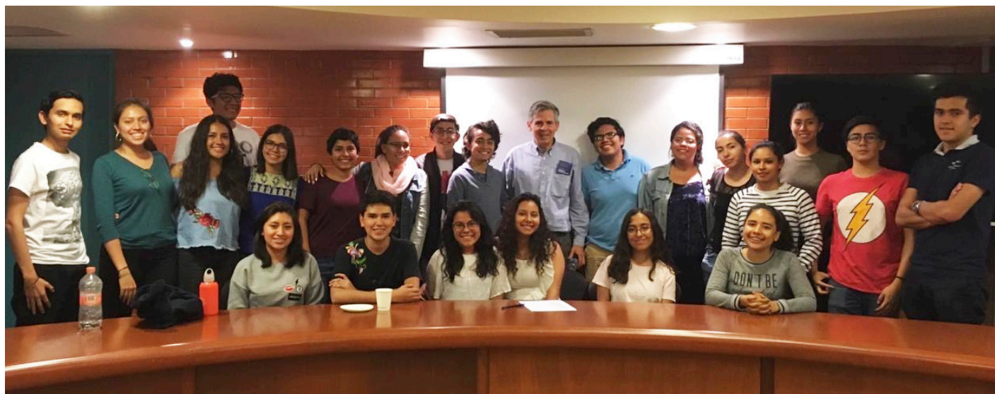
Fig. 2. Meeting with students of the Basic Biomedical Research and Neuroscience bachelor programs. Institute of Cellular Physiology, UNAM. Mexico City, April 2019.