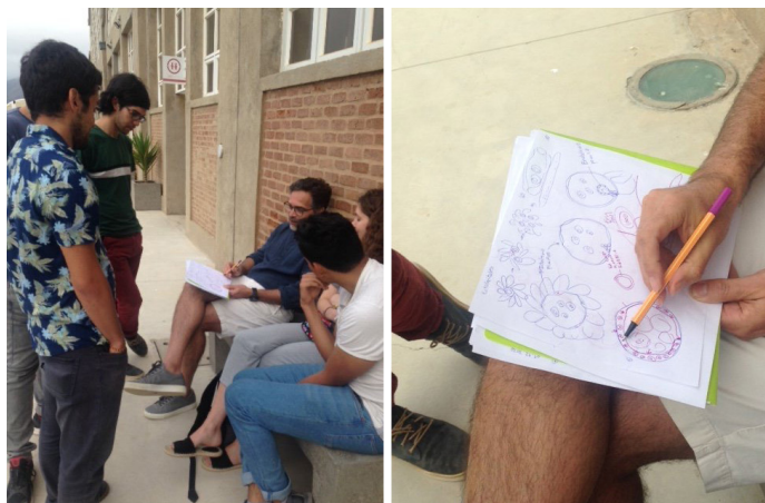
Fig. 6. Discussing planarian embryology with students at the International Developmental Biology course in Quintay, Chile.

rare, and helping to preserve, cultivate and grow them becomes more and more important as we grow older and gain perspective on what it takes to do science. I believe the Stowers to be such a place and as such, the Institute is uniquely positioned to become a fountainhead of biomedical research innovation, a place where fundamental problems of biology can be systematically and rigorously dissected, a place where scientists can follow ideas of great substance, whether they are fashionable or not. The Stowers is relatively young, barely 20 years, and what it has accomplished thus far is nothing short of extraordinary. I envision the Institute's research efforts will not only continue to grow in depth and complexity in the years ahead, but also that such efforts will extend into novel areas of inquiry where few would dare to go, while creating new models of how to carry out great science. I consider myself fortunate that in my career I will have a chance to contribute to this unique, collective effort to advance human knowledge (Fig. 5).