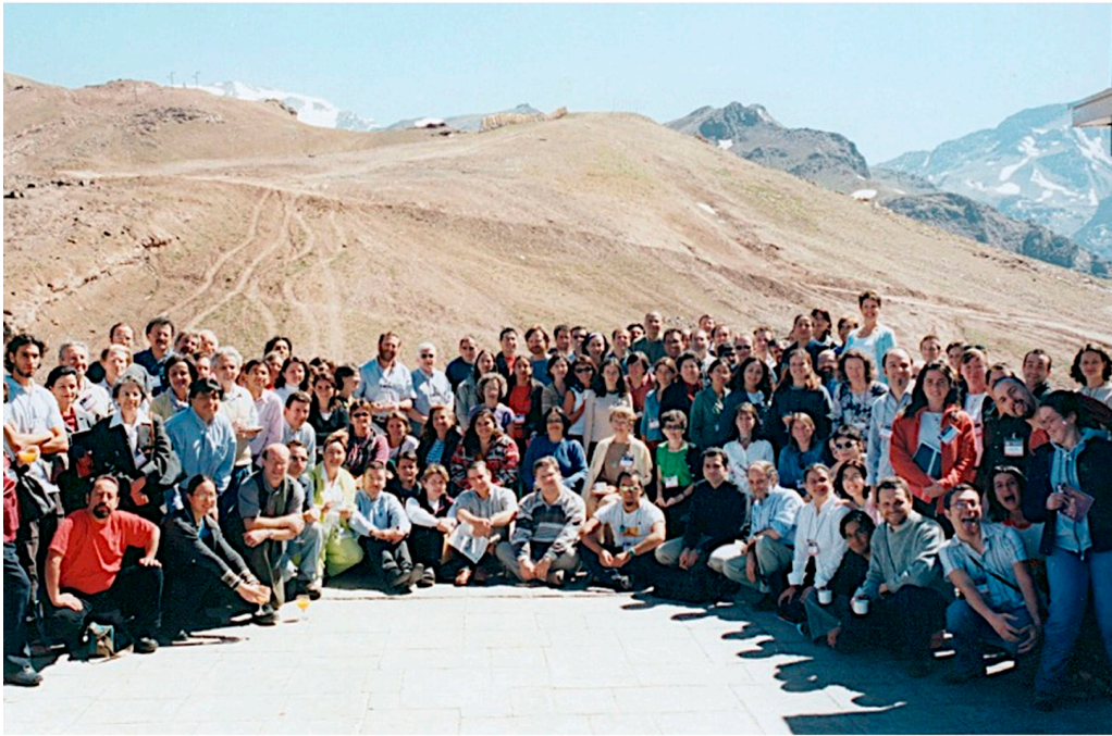
Fig. 2. Photograph of the participants at the first congress of the Latin American Society for Developmental Biology (LASDB, 2003). Several of the current members of the LASDB met at that congress for the first time.

confocal microscopy for the study of embryos of different organisms. The Leloir Institute houses good facilities for this type of course, and the course was successful. The conference began with an opening lecture by Eric Weischaus on the developmental pattern of gastrulation in Drosophila . This time, in addition to speakers from the United States and Europe, we had guests from Israel, such as Benny Shilo, and from Japan, such as Shigeo Hayashi, along with researchers from across Latin America. Many of the talks of this congress focused on different levels of development that practically covered all animal models from planaria to mammals through C. elegans , Drosophila , zebrafish, Xenopus , chick and mouse. Extraordinary presentations were also given on the development of organisms that are not classical models.