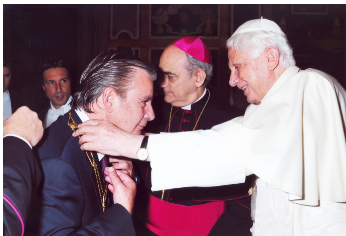
Fig. 6. Eddy De Robertis being inducted into the Pontifical Academy of Sciences by Pope Benedict XVI in 2010 at the Vatican. In the background Bishop-Chancellor Marcelo Sánchez Sorondo. De Robertis attends every biennial plenary meeting of this very stimulating Academy.

Stefano Piccolo purified Chordin protein and showed that it directly bound to BMP, antagonizing its activity (Piccolo et al. , 1996). He also discovered that inhibition by Chordin could be reversed by a metalloproteinase called Tolloid/Xolloid that cleaves Chordin at specific sites, releasing BMP for signaling through its receptors (Piccolo et al. , 1997). Chordin protein diffuses from the dorsal side to the ventral pole within a narrow region of extracellular matrix that separates ectoderm from endomesoderm in the gastrula. On the ventral side, high BMP signaling leads to the expression of Sizzled , a protein that we showed was dedicated to the competitive inhibition of Tolloid. The BMP/Chordin/Tolloid/ Sizzled regulatory system represents probably the best understood self-organizing morphogen gradient. We cloned many other genes from the organizer, such as Cerberus and Frzb . Many were Wnt antagonists, leading to our interest in the integration between the BMP and Wnt pathways at the level of phosphorylations of the Smad transcription factors (Leyns et al. , 1997; Piccolo et al. ,