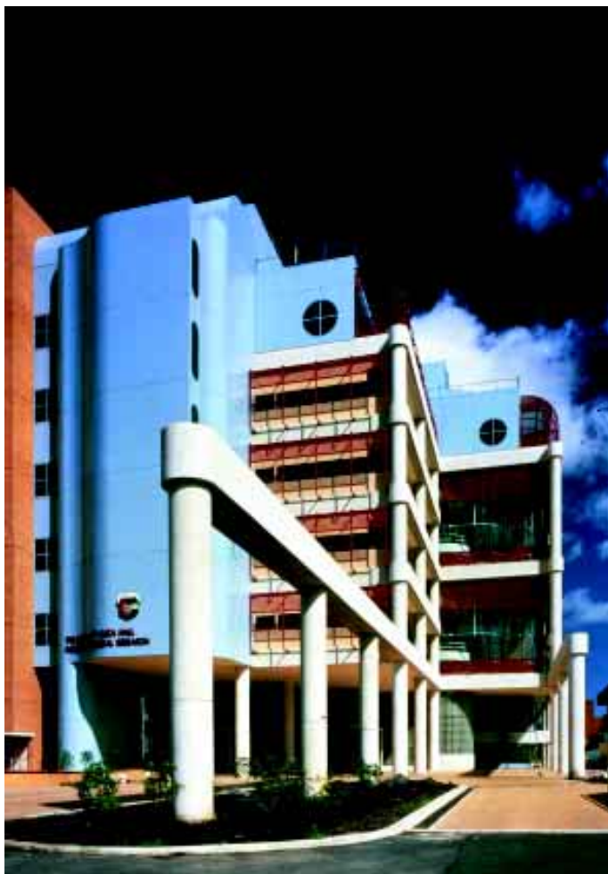
Fig. 1. The Walter and Eliza Hall Institute is one Melbourne's - and Australia's - oldest and most respected research institute. It resides at the hub of one of the world's great biomedical research precincts, the "Parkville strip", just north of the city's centre.

In Western Australia, local meetings of the Cell Biology Society from 1987-1989 formed the basis for the major Combined Biological Sciences meeting now held annually. It was not until 1997 that the Cell Biology Society changed its name to the Australia and New Zealand Society for Cell and Developmental Biology ( http://www.anzscdbi.adelaide.edu.au/ ) as the interests of its membership in the field of the developmental biology continued to grow.