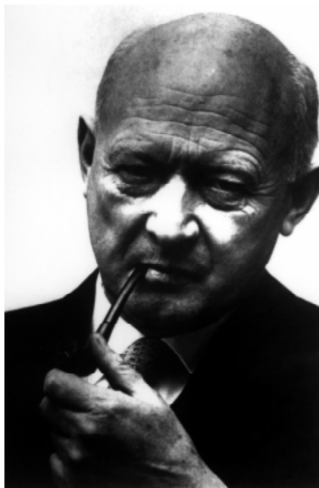
Fig. 1. Conrad H. Waddington. Reproduced from Robertson (1977).

There follow several more publications on induction in the chick. In 1933 he reports that the mesodermal parts of the primitive streak, the "head process and sinus rhomboidalis" and the neural plate can all induce an axis in the host, while the notochord cannot (Waddington, 1933c). He comments that the orientation of the induced axis is controlled at least in part by the graft, suggesting that the early primitive streak already has polarity. Waddington and Schmidt (1933) continue these experiments using duck/chick combinations and even attempt to film some of the grafts in time-lapse, in collaboration with Dr. R.G. Canti at St. Bartholomew's Hospital in London (who had previously aided Honor Fell in producing films of the growth of joint cartilages in vitro ). The experiments, and particularly the visualisation of cell movements