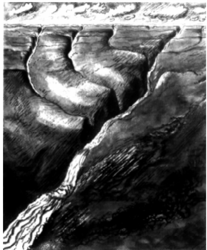
Fig. 2. Two visual representations of 'epigenetic landscapes'. (A) "A symbolic representation of the developmental potentialities of a genotype in terms of a surface, sloping towards the observer, down which there run balls each of which has a bias corresponding to the particular initial conditions in some part of the newly fertilised egg. The sloping surface is grooved, and the balls will run into one or other of these channels, finishing at a point corresponding to some typical organ". Figure and legend from Waddington, 1956; p. 351. (B) Epigenetic landscapes depicted as branching valleys (from Waddington, 1940, reproduced with kind permission of Cambridge University Press).

"The Wolffian duct may therefore be said to induce the mesonephros, which, however, has a feeble power of self-differentiation as a double assurance" ... "This provides confirmation of previous