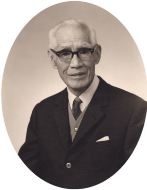
Fig. 2. Prof. Tadao Sato shortly before his retirement in 1966 at the age of 63. He lectured in histology and comparative anatomy in the Department of Biology in Nagoya University.

conduct experiments for lens regeneration using techniques such as microsurgery, vital staining and so on. I carefully traced the developmental process in cyclopean embryos, which could be produced by removing the pre-caudal plate at the early neural plate stage using the method established by Mangold in 1933. I operated on more than 5,000 newt neurulas, and found that removal of the pre-caudal plate led to arrest of lateral extension of the presumptive eye anlage, located under the medio-anterior end of the neural plate as a single region, resulting in development of a single optic vesicle at the medio-ventral part of the head region.