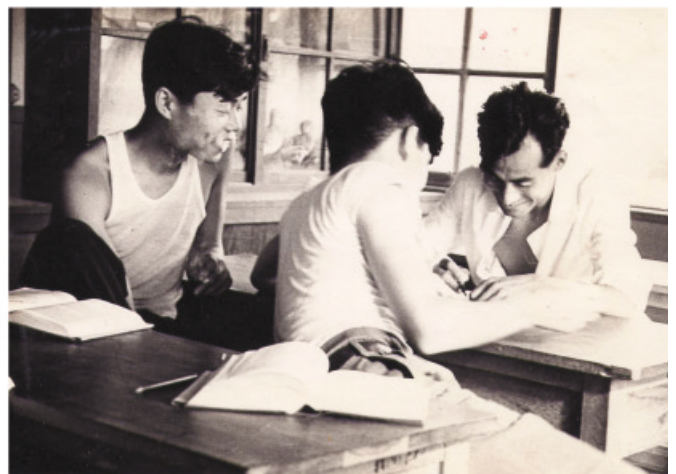
Fig. 3. Prof. Tadao Sato inspiring 4th year students in the Department of Biology at Nagoya University in 1955.

I performed the following experiments, which exposed essential contradictions in Spemann's hypothesis. When the lens of a larval newt was ventrally shifted and fixed with a thin glass bar, to make a gap between the dorsal marginal iris and the lens surface, a supernumerary lens was formed from the dorsal iris, while the original lens continued to grow. In addition, simultaneous removal of the lens and