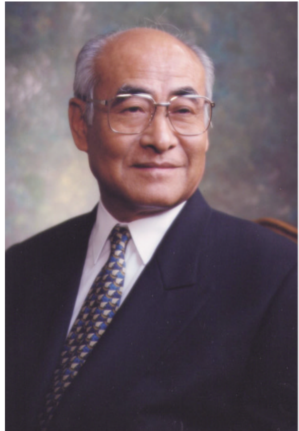
Fig. 5. Goro Eguchi, President of Kumamoto University (2001).

Based on the nitrosoguanidine result mentioned above, I immediately started cell culture analyses of pigmented epithelial cells from adult newts and from older chick embryos at 9 to 11 days of incubation. I could clearly show by clonal analysis that both dorsal and ventral iris epithelial cells from chick embryos invariably transdifferentiate into lens cells, to form lentoids expressing strong lens specificities in vitro . Professor Okada did not accept this result